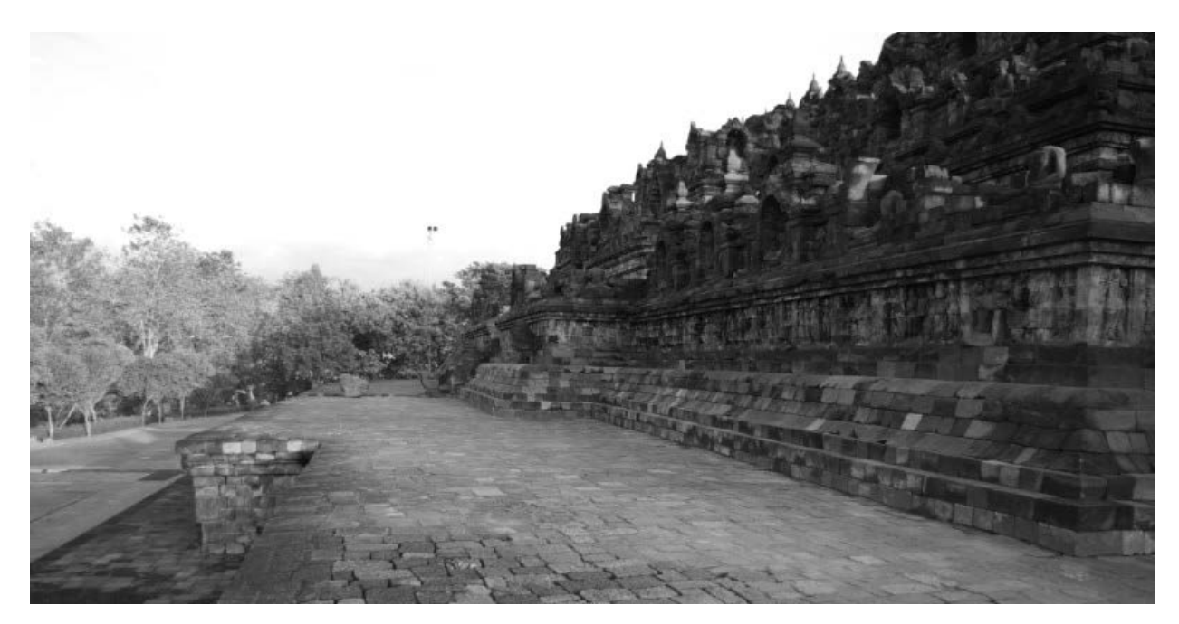
Figure 7 Kamadhatu stage, one of the foot of the temple that contains pictures of human life.

when human still tied with desire or lust. Rupadhatu, 4 steps above, represents human have been released from desire but still tied with form and shapes, at that stage, statues of Buddha coverless-ly open placed. Arupadhatu, 3 steps above, the statues of Buddha installed inside a stupa with holes, as a symbol when human releases from desires, form and shapes. Rupadhatu, the top, represents nirvana, the place where Buddha's lives.