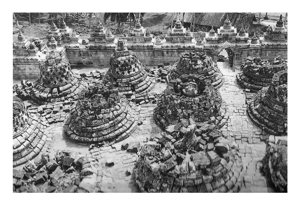
Figure 5 Borobudur temple when first time captured by Duthc historian Van Erp for to be rebuild.

Because deciding about the old, fragile and about to crumble building, Cornelius reported to Raffles about this discovery with some pictures. By this discovery Raffles earned an honor as the first person who start the revitalization of Borobudur temple and earned the world's attention(Soekmono, 1991, 14). In 1835, by the command of Hartman, Second Residence at that time, because his big interest in Borobudur temple, he command the entire citizen to clean all the area so the temple successfully dig and free from any view boundaries.