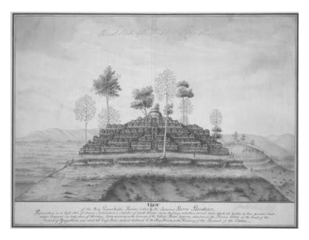
Figure 1 Borobudur temple drawing by P. Beedeer

Syailendra is a king of Medang kingdom from Wangsa that empowered in the years of 792-835 AD (Munoz, 2006, 171). For the architect that honored in designing this temple, as told by hereditary tales, is named Gunadharma. The possibilities of this temple built around the years of 824 ADand finished around the years of 900 AD in the governance of Queen Pramudawardhani, the daughter of Samaratungga<sup>1</sup>.