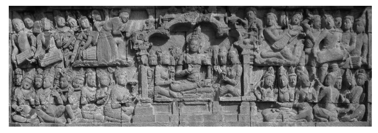
Figure 6 Bodhisattva in nirvana of Tusita scene of Lalitavistara, East Wall, first Panel (Source: Lalitavistara dalam relief Borobudur)

Casparis predicted that Bhūmi Sambhāra Bhudhāra in sanksksrit means "hills of group of goodness ten levels of boddhisattwa" is the real name of Borobudur. On the relief, Borobudur tell a story about a legend, with various in its story, there are the story of Wiracita Ramayana, reliefs of Jātaka story, and also Lalita Vistara. Beside that, there are also reliefs that picture the civilization condition at that time. For example, the reliefs about farmer's activities. represents the development of farming technologies at that time and reliefs of ships, as representation of development of sailing at that time.