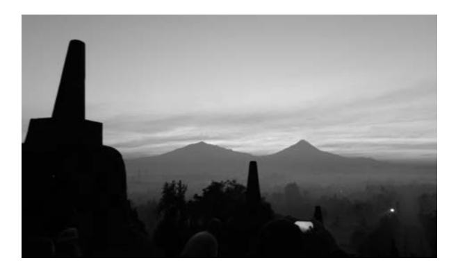
Figure 2 Borobudur was built not far from Mount merapi, the volcanic dust so that it becomes one of the causes of damage of the rock Temple.

Few theories revealed by the experts about why Borobudur temple was abandoned and left unknown by Buddhist civilization in this area. One of the theories which proposed is Borobudur originally built around swamped habitat and then drowned by the eruption of Merapi volcano. That argument was taken from the Kalkutta inscription that written "Amawa" which means "Sea of Milk". That word then translated as lava of Merapi, the possibilities of Merapi buried by cold lava (mud-like materials) around the year of 800 AD, along with the end of Mataram Empire in the year 930 AD the next central civilization and culture of java moving to the east side in the year of 1006 AD. (Murwanto et.al., 2004, 459-463)