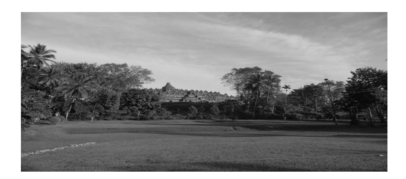
Figure 3 Borobudur means of "a vihara or dormitory in the hills", was build on hills in lake so likes Lotus flower in the bowl.

There is no any written evidence which older that gave the name "Borobudur" to this temple. The only old document that directing the existence of this temple is the book of Nagara Kertagama, which written by Mpu Prapanca in the year of 1365 AD. It's written this book, that this temple used as place for meditation of Buddhism believer. Beside that, there are some other folks etimology, as example, the word of "Borobudur" originated from the phonetic sound of pronounce "para Buddha" (The Buddhist Believer) then audioly dragged turned to be "Borobudur".